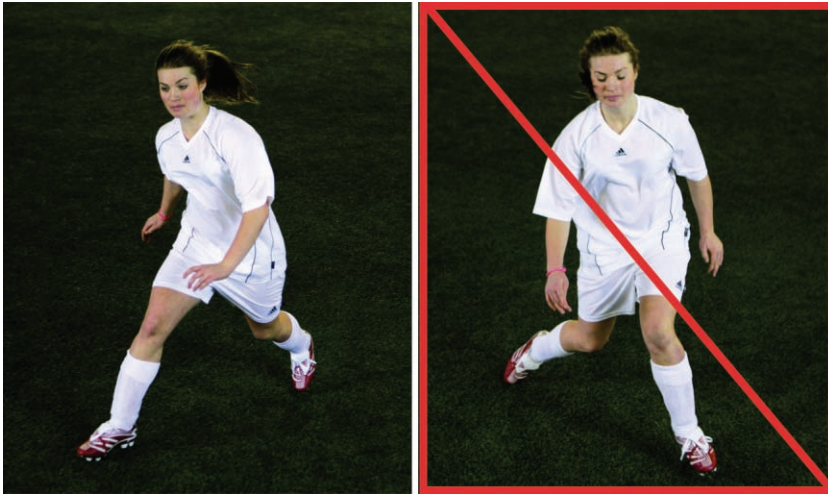
Fig 2 | Example of running exercise illustrating key objectives of all running, jumping, cutting, and landing exercises: core stability and correct lower extremity alignment. Left: correct technique; right: incorrect technique with pelvic tilt and knee valgus alignment to right

per club and a dropout rate of 15%, which means that we needed to include about 120 clubs with 2150 players.